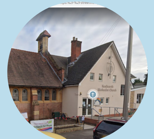
Other Buildings eg Church